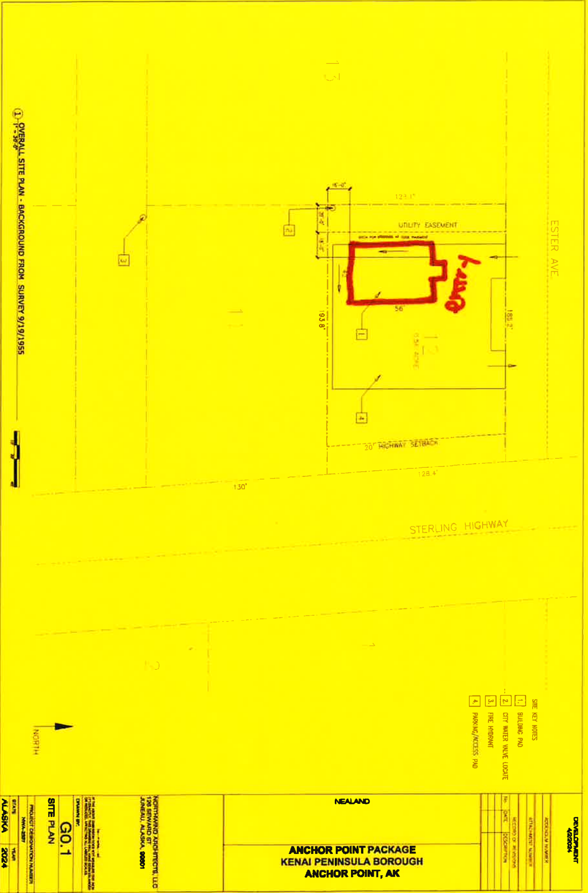
① OVERALL SITE PLAN - BACKGROUND FROM SURVEY 9/19/1955